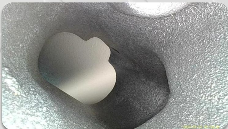
Casting Inspection with 6mm HXVB6015