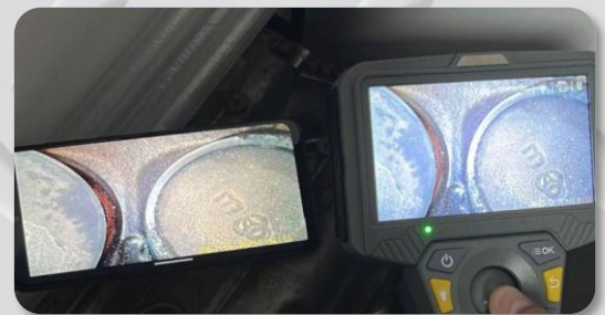
Hawkeye® X-PLOR using WiFi iOS and Android